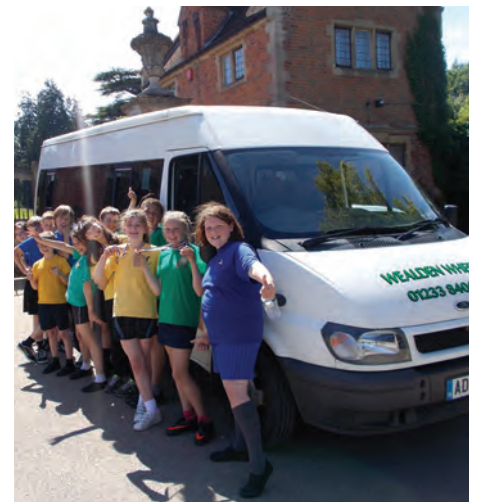
Above: Students from St. Mary's, Chilham, with their haul of 'Olympic' medals.